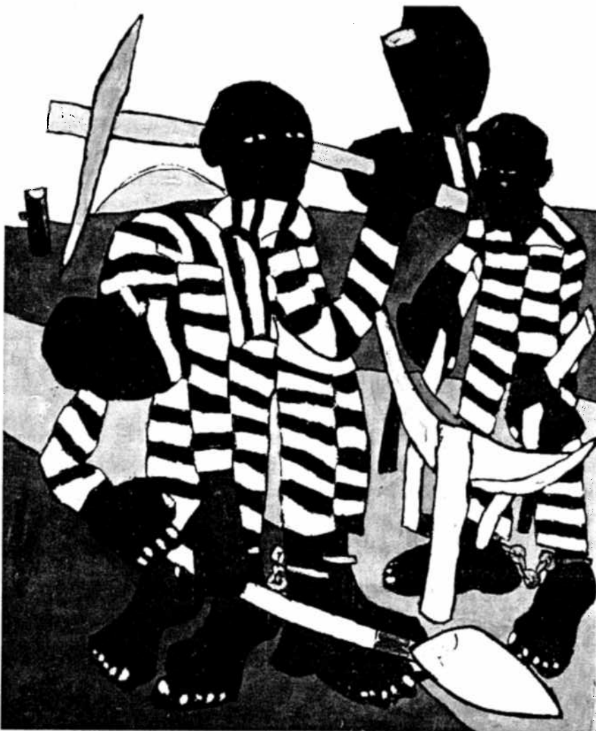
Chain Gang (1939–1940), William H. Johnson.

Scarcely a breath of wind disturbed the stillness of the day, and the long rows of cabbages were bright green in the sunlight. Large white clouds drifted slowly across the deep blue sky. Now and then they obscured the sun and caused a chill on the backs of the prisoners who had to work all day long in the cabbage field.